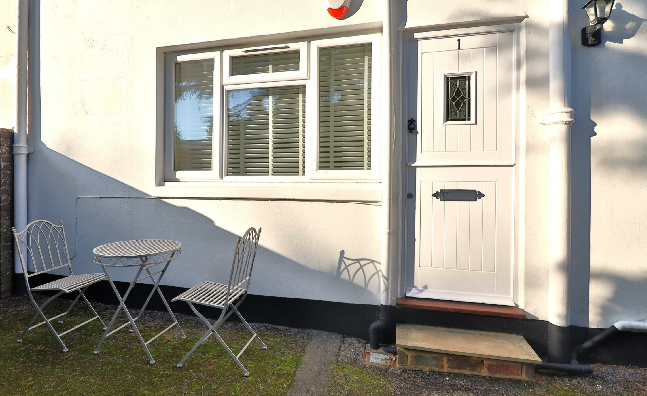
1 The Old Coach House Belsize Close, Worthing, BN11 4RF Guide Price £225,000